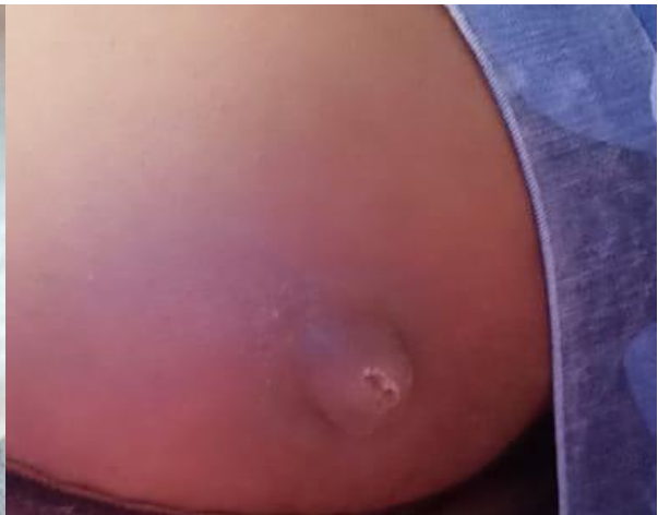
Fig: Dated on, 05/10/2021